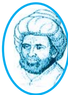
Muhammad ibn Musa al-Khwarizmi (C.E. 780 – 850)

A lemma is a proven statement used for proving another statement.