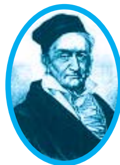
Carl Friedrich Gauss (1777 – 1855)

Carl Friedrich Gauss is often referred to as the 'Prince of Mathematicians' and is considered one of the three greatest mathematicians of all time, along with Archimedes and Newton. He has made fundamental contributions to both mathematics and science.