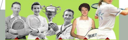
Don Budge (1938), Maureen Connolly (1953), Rod Laver (1962 & 1969), Margaret Court (1970), Steffi Graf (1988)

*Players who have completed a calendar Grand Slam - winning Australian Open, French Open, Wimbledon and US Open in a year - in singles